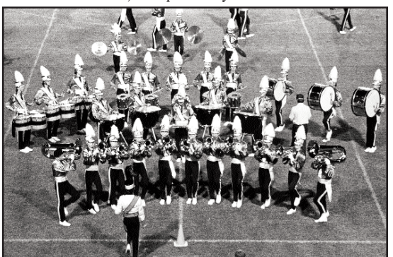
Toronto Optimists, 1973.

The next two years were spent in the wilderness, competitively. Concerns arose as