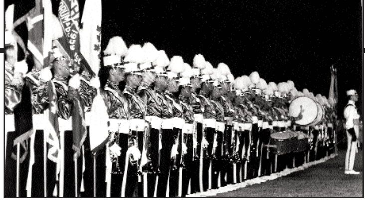
Toronto Optimists in their new uniforms, 1962 (photo from the collection of Vern Johansson).

In May 1958, the new Toronto Optimists made their first appearance at an indoor show at the Fort York Armories in Toronto. They wore brand-new uniforms designed by Bell -- green satin blouses with a white diagonal stripe, black pants with white stripe, white shoes, a cummerbund of white and green and white shakos with green trim and white